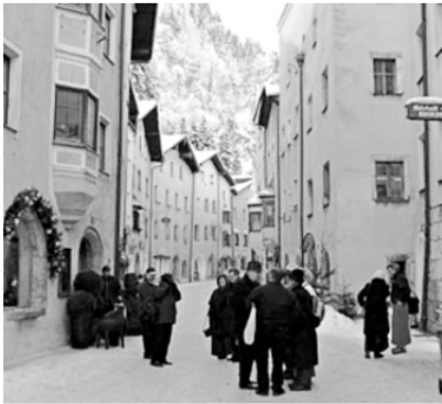
Pilgram Marpeck , who lived in this house (on the left, with the bay window) held a good job at Rattenburg on the Inn. A mining engineer and government official, he lived far more comfortably than most people of his time. But when he turned to Jesus and became a servant of his church community, he lost everything he owned. Not just once, but time and again, as he moved from place to place to tend to Jesus' flock in need.